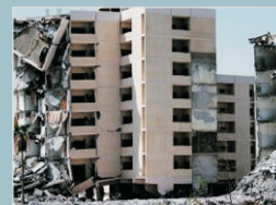
Earthquakes and Natural Disasters

Designed to meet ASTM E2484-06 Compliance