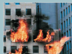
Acts of Terror and Fire